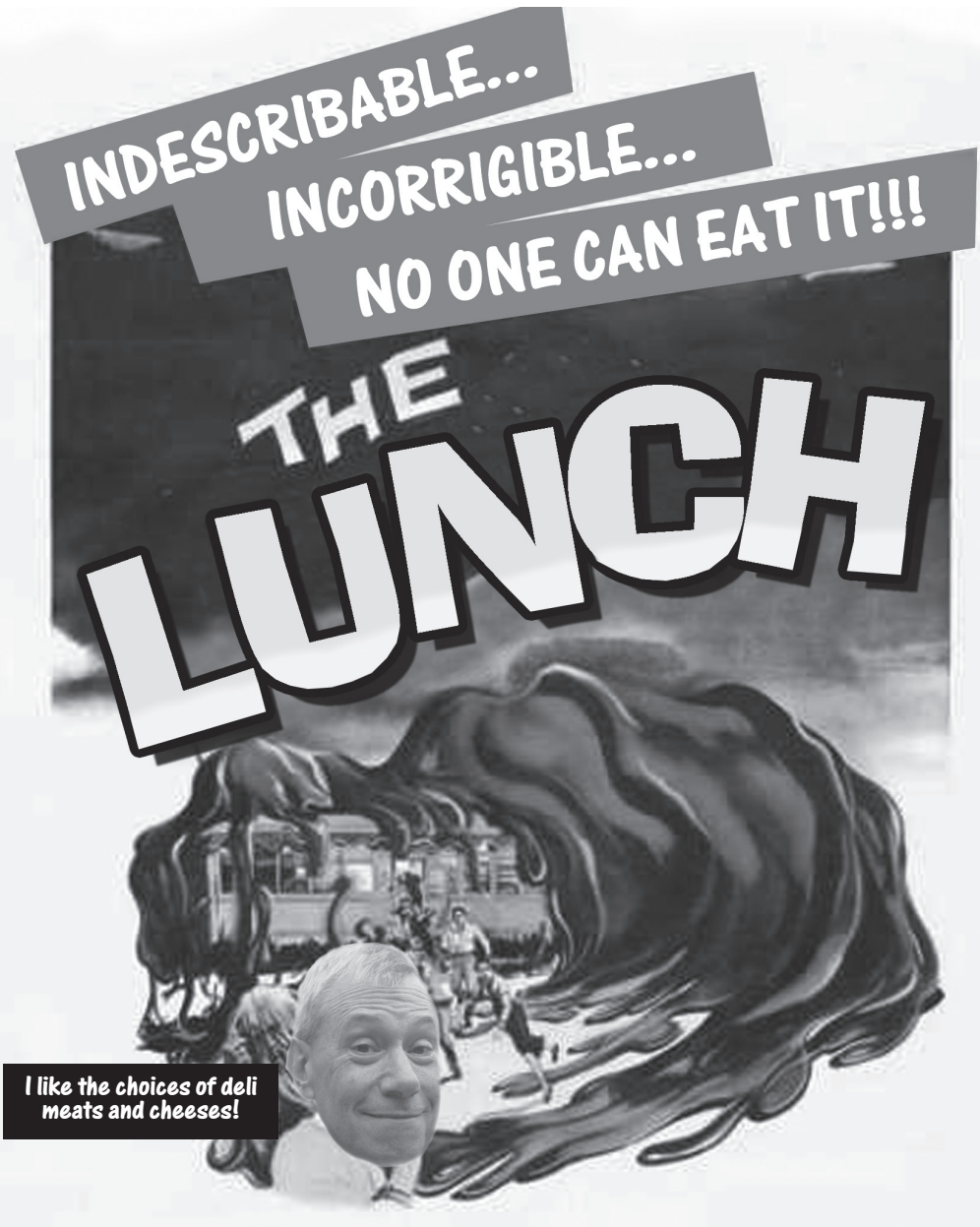
I like the choices of deli meats and cheeses!

Nothing is scarier than a wild turkey (the bird NOT the drink), but you have a chance to get back at those fowl birds. You can buy a North of Forty Raffle ticket or pawn off to your friends, either way more than likely to be tastier and more appetizing than our regular lunch at Rotary. For the record 10th year we will be supporting the Rotary Foundation which in turns help fight Polio and other mighty worthy causes. You need to sell 5 tickets or more if you like. Plus when you win you'll enjoy the bird that Ben Franklin thought should be the national bird. (Ben didn't get them all right). Sell baby sell drawing held on November 15th you have lots of time to peddle those tickets!!