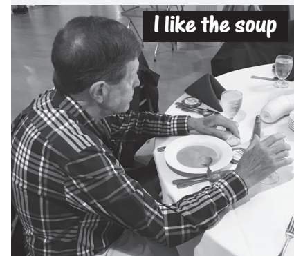
I like the soup

A lunch so vile, so hideous that it would never pass even the one way test!!! Once a week it rears it's ugly mug from the depths of the Danversport River and renders its consumers to a host of dietary distress, GLUTEN FREE, LACTOSE INTOLERANT, VEGAN!! The earth may never recover, will YOU!!!